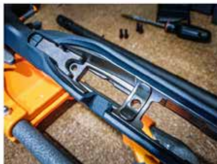
The Magpul stock's cast aluminium bedding block and dual recoil lug system.

Hold on, what about the magazine? The Magpul PMag (marked for the military 7.62x51) is constructed from polymer and houses five rounds. It is very well made and loading and unloading shells is effortless. There is a large ambidextrous magazine release lever located behind the magazine. It works fine but there is the potential for it to inadvertently drop the mag if it gets caught on some scrub etc. You'd have to be very unlucky for that to happen though.