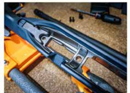
The Magpul stock's cast aluminium bedding block and dual recoil lug system.

Hold on, what about the magazine? The Magpul PMag (marked for the military 7.62x51) is constructed from polymer and houses five rounds. It is very well made and loading and unloading shells is effortless. There is a large ambidextrous magazine release lever located behind the magazine. It works fine but there is the potential for it to inadvertently drop the mag if it gets caught on some scrub etc. You'd have to be very unlucky for that to happen though.