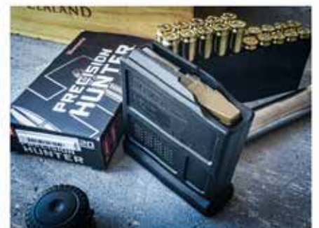
The Magpul PMAGs have a reputation for high quality and excellent durability.

Hold on, what about the magazine? The Magpul PMag (marked for the military 7.62x51) is constructed from polymer and houses five rounds. It is very well made and loading and unloading shells is effortless. There is a large ambidextrous magazine release lever located behind the magazine. It works fine but there is the potential for it to inadvertently drop the mag if it gets caught on some scrub etc. You'd have to be very unlucky for that to happen though.